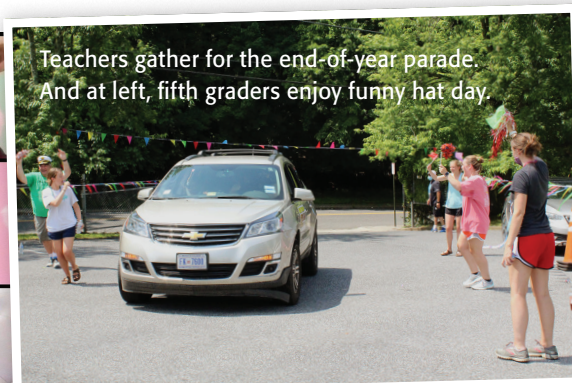
Teachers gather for the end-of-year parade. And at left, fifth graders enjoy funny hat day.